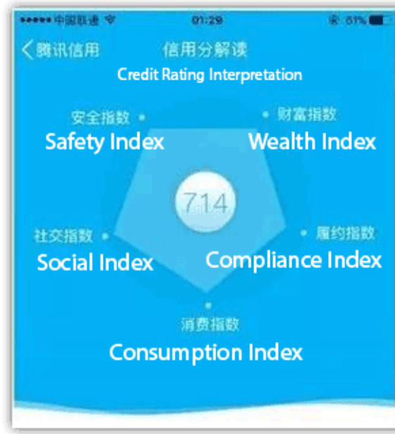
Chinese Social Credit Score Interface