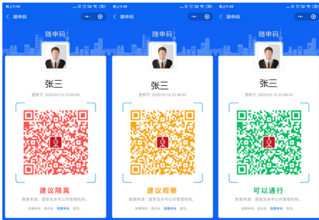
Screenshots from Shanghai's official Health QR Code app

The concept and design of this app emulates a system already in use in China.