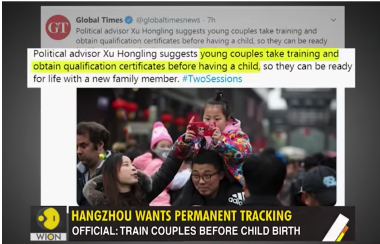
Reporting from The World is One News Channel