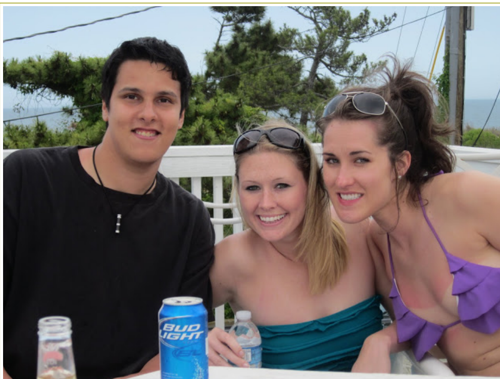
Soakin' up some rays