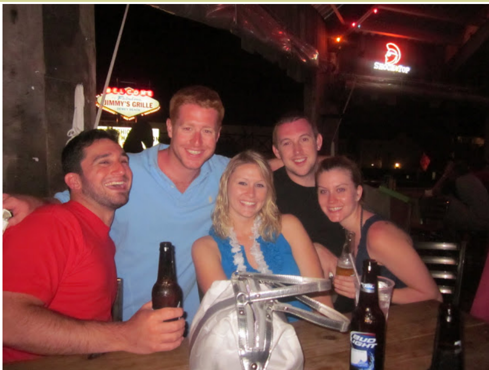
Last Night in Dewey- Until next year!

POSTED BY HEATHER AT FRIDAY, JUNE 24, 2011