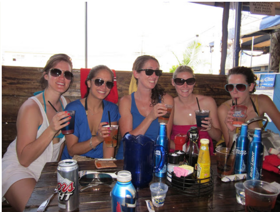
The Ladies on Day #1