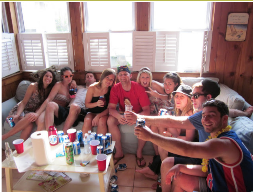
Most of the crew hanging out