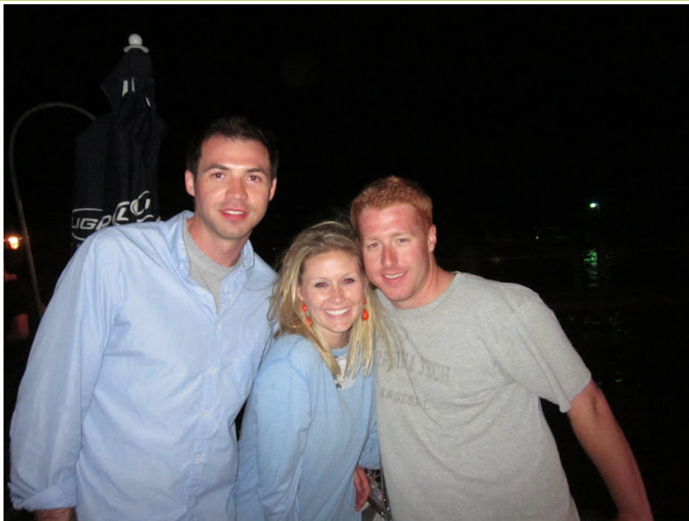
Some of my favorite boys