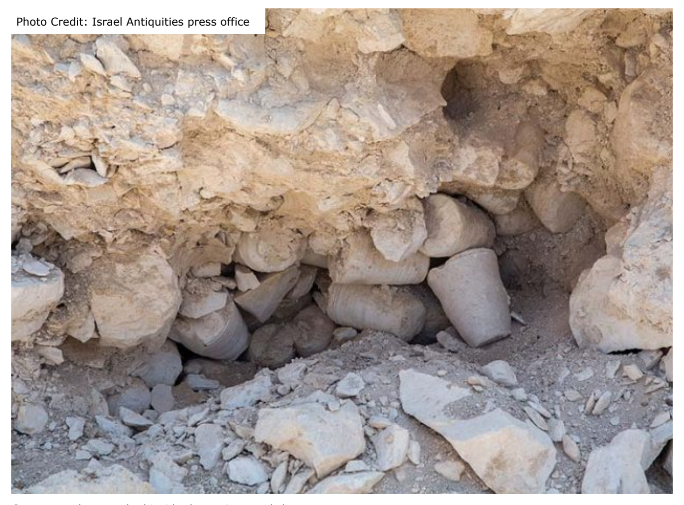
Stone vessels unearthed inside the ancient workshop

By JNi.Media - 18 Av 5777 - August 10, 2017