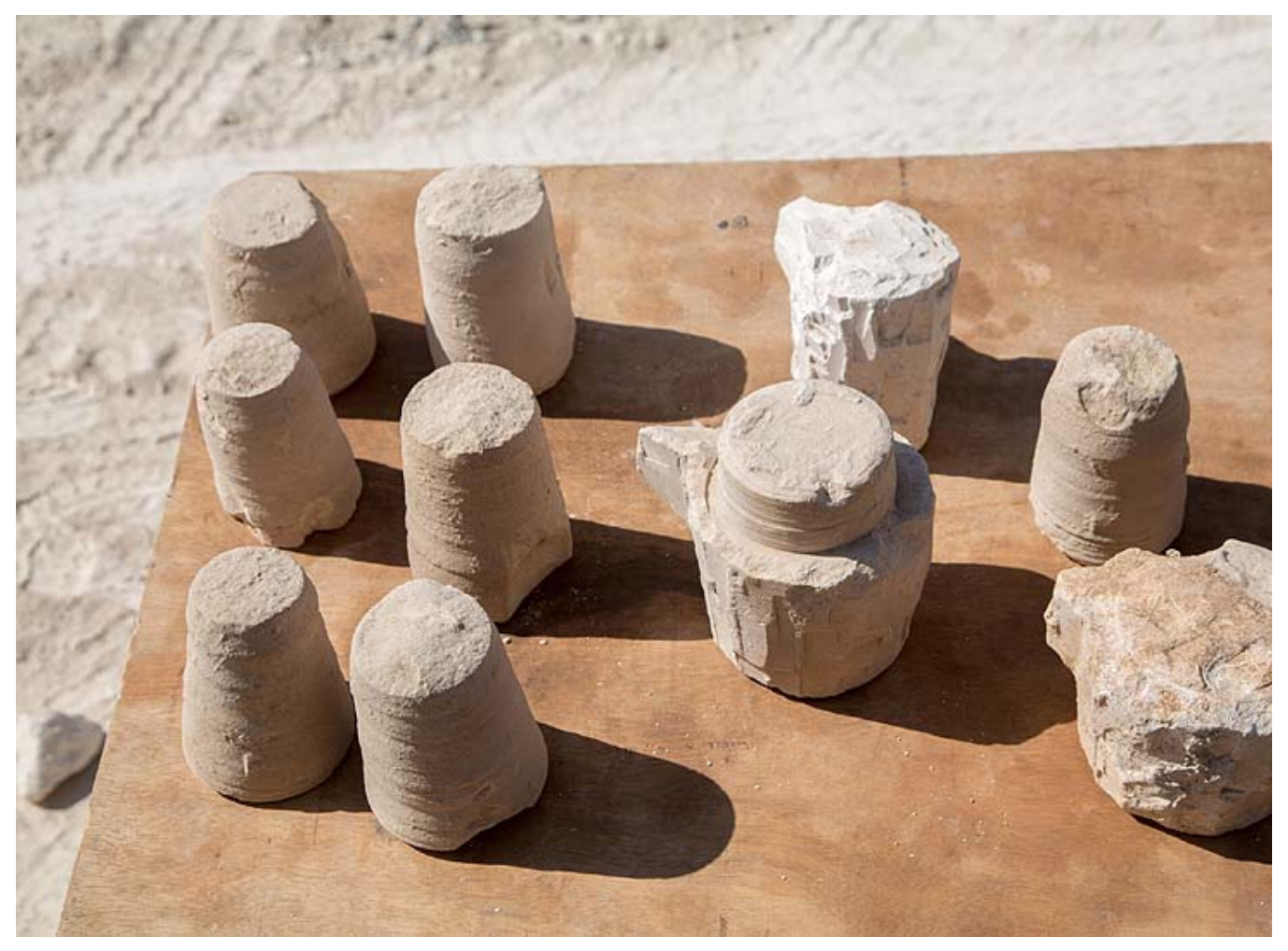
Stone vessels unearthed inside the ancient workshop

The ancient site was uncovered during the course of construction work at a municip sports center conducted by the Reina local council. This is the fourth workshop of it ever to have been uncovered in Israel; an additional workshop is currently being ex near Reina, located one kilometer from the current site. The two remaining known were uncovered decades ago far to the south, in the Jerusalem area.